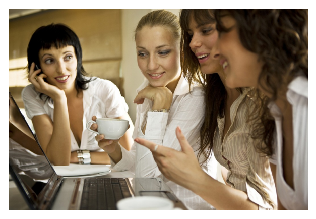
Qualitative Assessment of Student Perceptions about Departmental Programs

To this end, the AC was charged with completing several activities described in the prospectus. The goal of these activities and structures was purposed to strengthen relationships and provide improved pathways for information sharing between students, graduates of the program, and employers of program graduates.